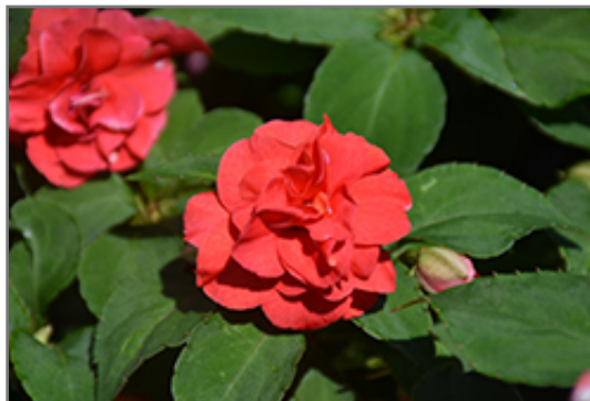
Rockapulco Red Impatiens flowers

Rockapulco Red Impatiens is recommended for the following landscape applications;