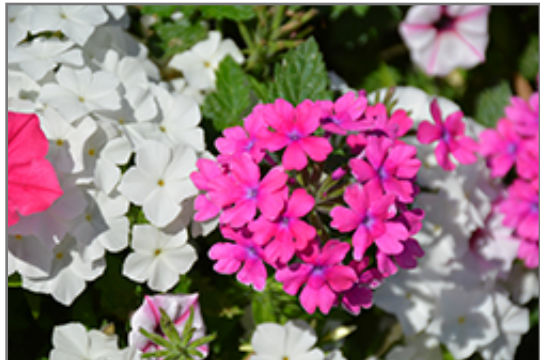
Superbena Pink Shades Verbena flowers

Superbena Pink Shades Verbena is recommended for the following landscape applications;