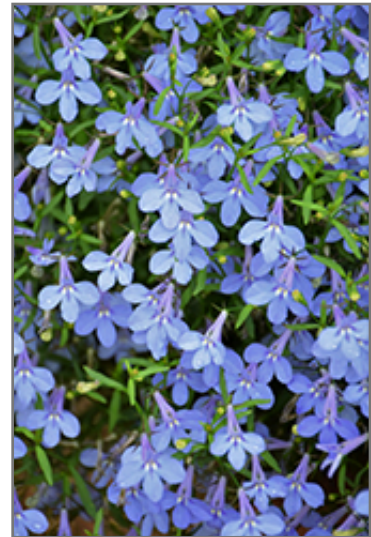
Hot Waterblue Lobelia flowers

Hot Waterblue Lobelia is a fine choice for the garden, but it is also a good selection for planting in outdoor pots and containers. It is often used as a 'filler' in the 'spiller-thriller-filler' container combination, providing a mass of flowers against which the thriller plants stand out. Note that when growing plants in outdoor containers and baskets, they may require more frequent waterings than they would in the yard or garden.