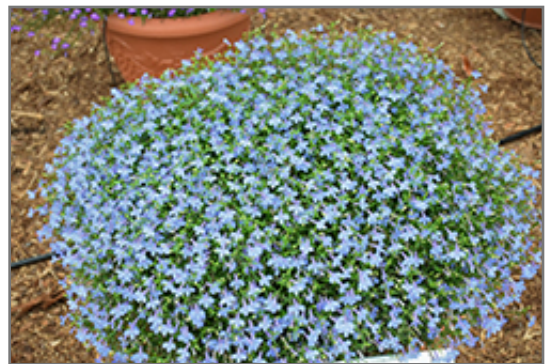
Hot Waterblue Lobelia in bloom