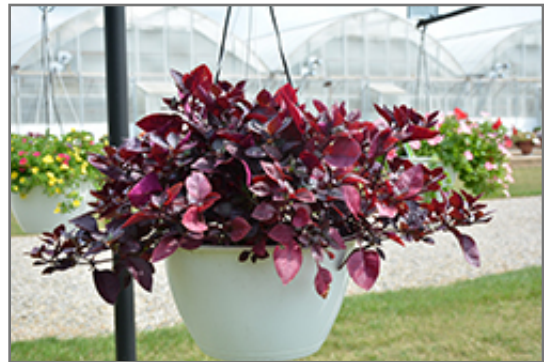
Brazilian Joy Weed