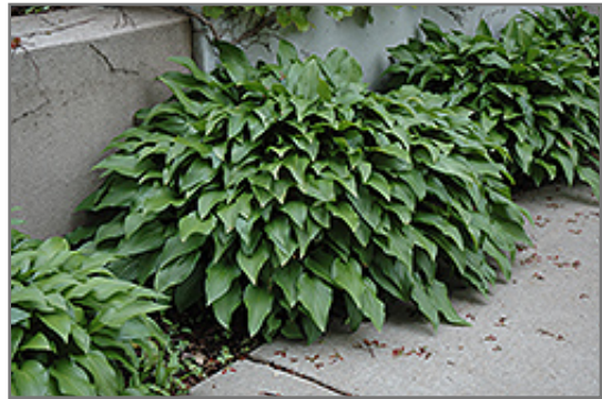
Invincible Hosta

Invincible Hosta is recommended for the following landscape applications;