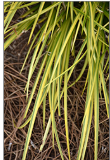
EverColor Everoro Japanese Sedge foliage

EverColor Everoro Japanese Sedge is recommended for the following landscape applications;