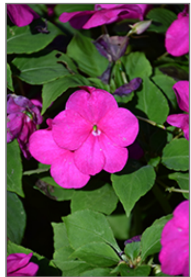
Beacon Violet Shades Impatiens flowers