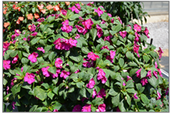
Beacon Violet Shades Impatiens in bloom

Beacon Violet Shades Impatiens will grow to be about 15 inches tall at maturity, with a spread of 12 inches. When grown in masses or used as a bedding plant, individual plants should be spaced approximately 8 inches apart. Its foliage tends to remain dense right to the ground, not requiring facer plants in front. This fast-growing annual will normally live for one full growing season, needing replacement the following year.