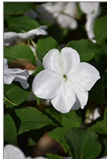
Beacon White Impatiens flowers

Beacon White Impatiens is recommended for the following landscape applications;