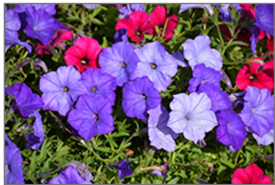
Easy Wave Lavender Sky Blue Petunia flowers