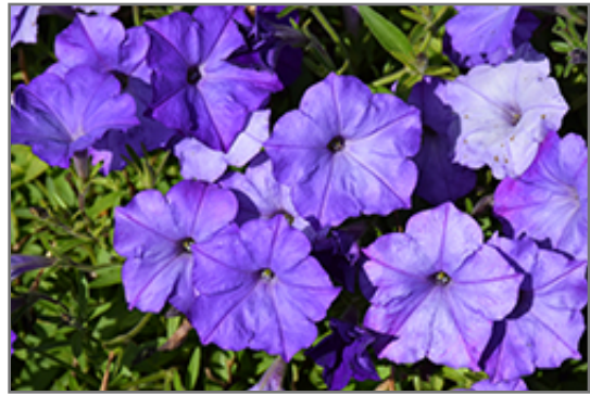
Easy Wave Lavender Sky Blue Petunia flowers

This plant will require occasional maintenance and upkeep. Trim off the flower heads after they fade and die to encourage more blooms late into the season. It is a good choice for attracting bees and hummingbirds to your yard, but is not particularly attractive to deer who tend to leave it alone in favor of tastier treats. It has no significant negative characteristics.