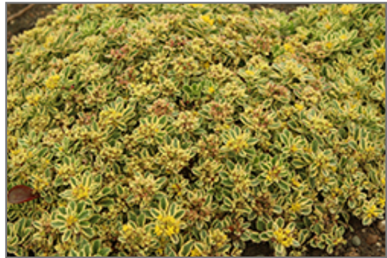
Rock 'N Low Boogie Woogie Stonecrop flowers

Rock 'N Low Boogie Woogie Stonecrop is a dense herbaceous perennial with a mounded form. Its medium texture blends into the garden, but can always be balanced by a couple of finer or coarser plants for an effective composition.