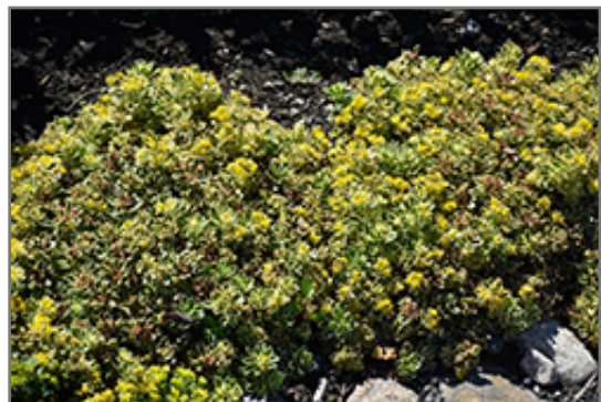
Rock 'N Low Boogie Woogie Stonecrop in bloom