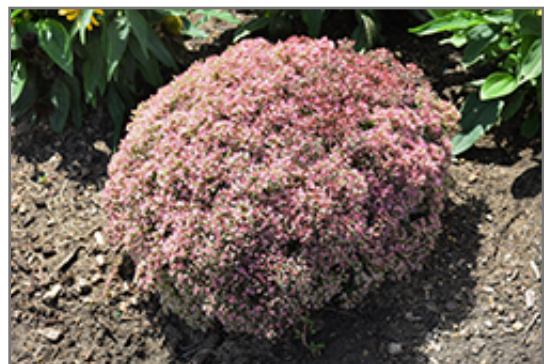
Rock 'N Round Pride and Joy Stonecrop in bloom