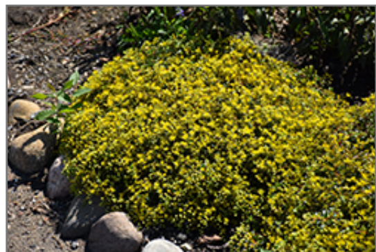
Rock 'N Low Yellow Brick Road Stonecrop in bloom