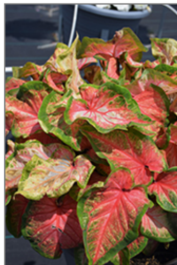
Heart to Heart Chinook Caladium foliage