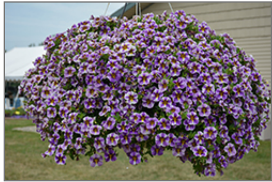
Superbells Holy Smokes! Calibrachoa in bloom

Superbells Holy Smokes! Calibrachoa is a fine choice for the garden, but it is also a good selection for planting in outdoor containers and hanging baskets. Because of its trailing habit of growth, it is ideally suited for use as a 'spiller' in the 'spiller-thriller-filler' container combination; plant it near the edges where it can spill gracefully over the pot. Note that when growing plants in outdoor containers and baskets, they may require more frequent waterings than they would in the yard or garden.