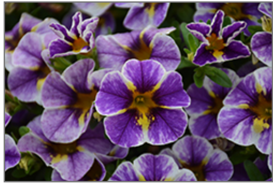
Superbells Holy Smokes! Calibrachoa flowers

Superbells Holy Smokes! Calibrachoa is a dense herbaceous annual with a trailing habit of growth, eventually spilling over the edges of hanging baskets and containers. Its medium texture blends into the garden, but can always be balanced by a couple of finer or coarser plants for an effective composition.