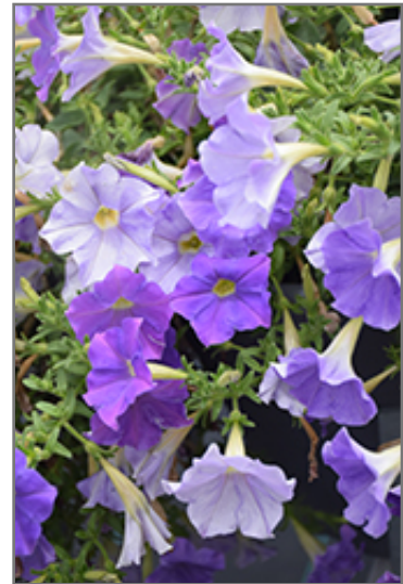
Supertunia Blue Skies Petunia flowers

Supertunia Blue Skies Petunia is recommended for the following landscape applications;