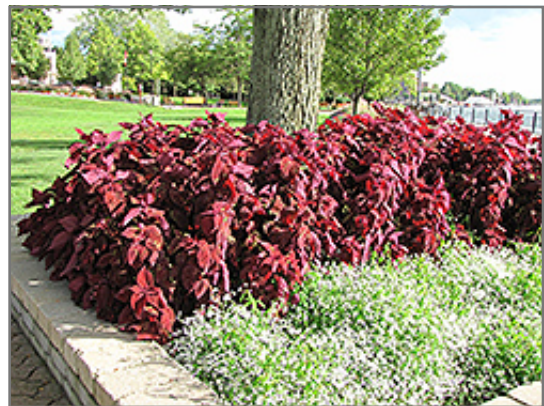
ColorBlaze Rediculous Coleus