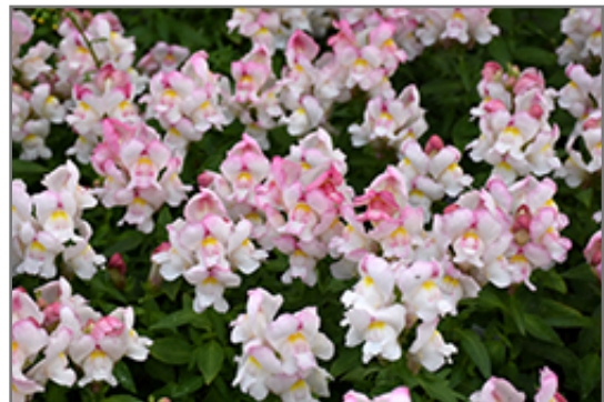
Snapshot Appleblossom Snapdragon flowers