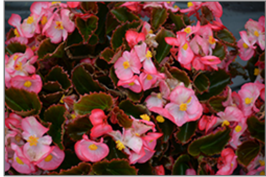
Senator IQ Rose Bicolor flowers