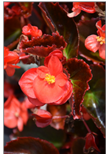
Senator IQ Scarlet flowers