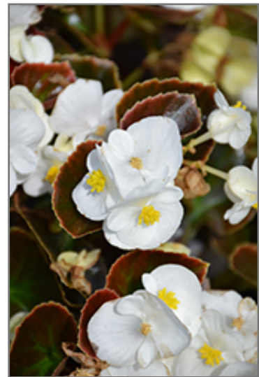
Senator IQ White flowers