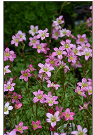
Touran Pink Saxifrage flowers

Touran Pink Saxifrage is recommended for the following landscape applications;