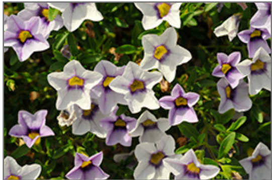
Calitastic Ice Blue Calibrachoa flowers

Calitastic Ice Blue Calibrachoa is recommended for the following landscape applications;