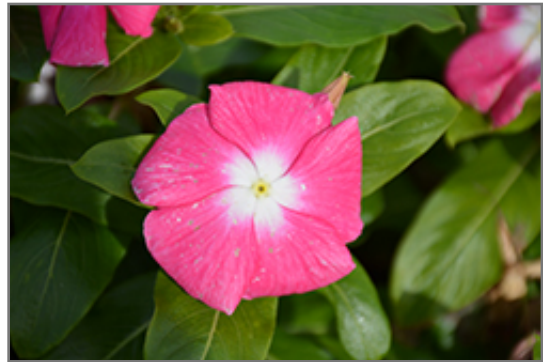
Cora XDR Pink Halo flowers

Cora XDR Pink Halo is recommended for the following landscape applications;