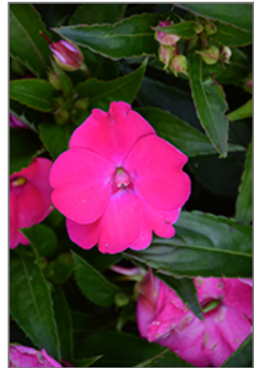
SunPatiens Vigorous Rose Pink New Guinea Impatiens flowers

This plant will require occasional maintenance and upkeep, and should not require much pruning, except when necessary, such as to remove dieback. It has no significant negative characteristics.