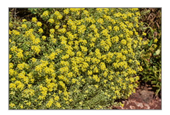
Mountain Alyssum flowers

Mountain Alyssum is recommended for the following landscape applications;