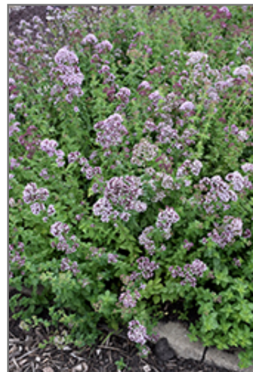
Oregano flowers