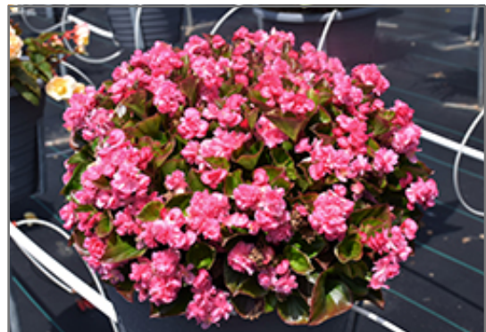
Double Up Pink Begonia in bloom