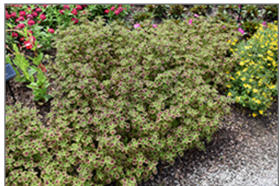
ColorBlaze Chocolate Drop Coleus