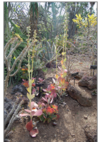
Paddle Plant in bloom