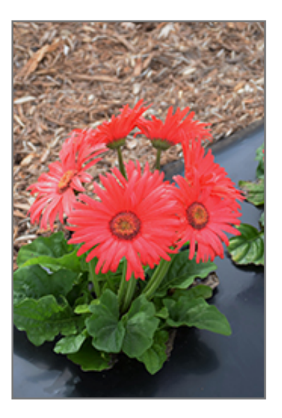
Flori Line Maxi Coral Gerbera Daisy in bloom

Wolf Hill Ipswich 60 Turnpike Rd (Route 1) Ipswich, MA 01938 978-356-6342