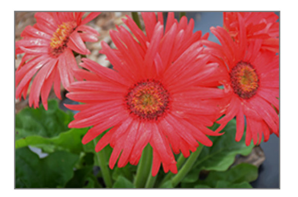
Flori Line Maxi Coral Gerbera Daisy flowers