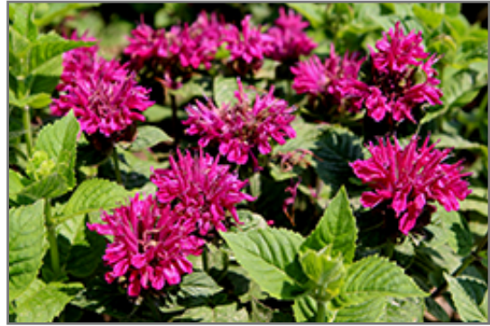
Marje Rose Beebalm flowers