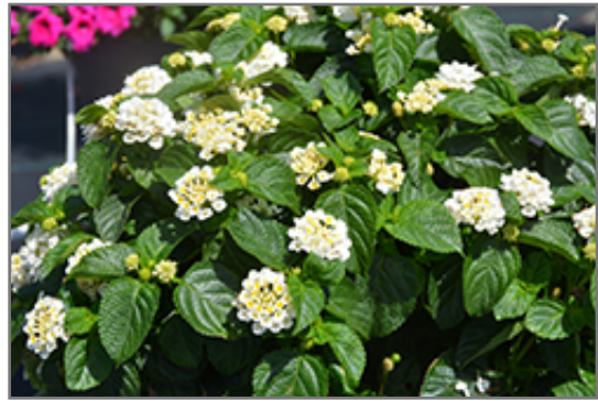
Havana Full Moon Lantana flowers

Havana Full Moon Lantana is a fine choice for the garden, but it is also a good selection for planting in outdoor containers and hanging baskets. It is often used as a 'filler' in the 'spiller-thriller-filler' container combination, providing a mass of flowers against which the thriller plants stand out. Note that when growing plants in outdoor containers and baskets, they may require more frequent waterings than they would in the yard or garden.