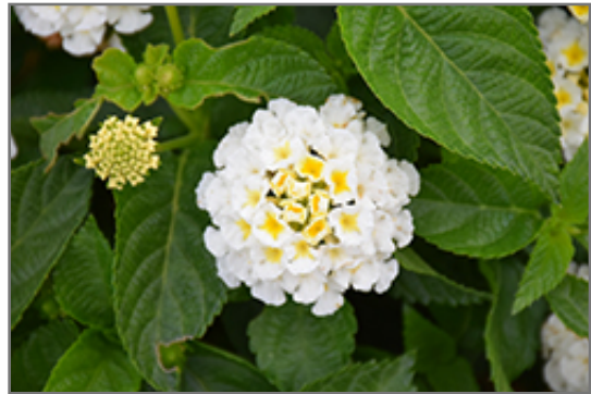
Havana Full Moon Lantana flowers

This is a relatively low maintenance plant, and should not require much pruning, except when necessary, such as to remove dieback. It is a good choice for attracting butterflies and hummingbirds to your yard, but is not particularly attractive to deer who tend to leave it alone in favor of tastier treats. It has no significant negative characteristics.