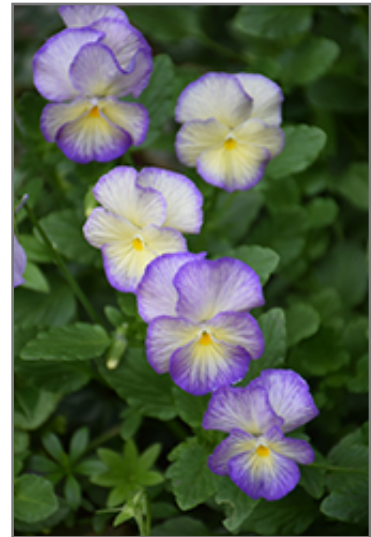
Etain Pansy flowers