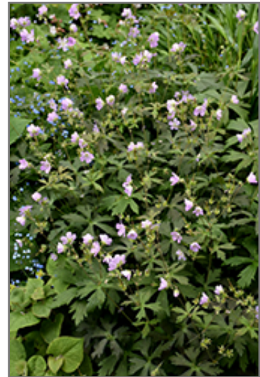
Espresso Cranesbill in bloom

Espresso Cranesbill is a fine choice for the garden, but it is also a good selection for planting in outdoor pots and containers. It is often used as a 'filler' in the 'spiller-thriller-filler' container combination, providing a mass of flowers and foliage against which the thriller plants stand out. Note that when growing plants in outdoor containers and baskets, they may require more frequent waterings than they would in the yard or garden.