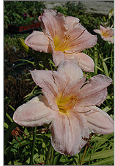
Barbara Mitchell Daylily flowers