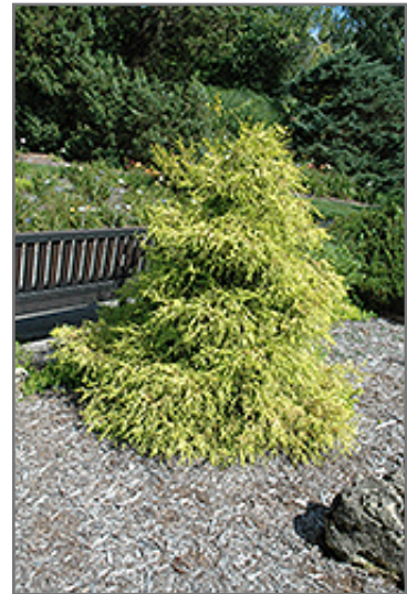
Lemon Thread Falsecypress

Lemon Thread Falsecypress is recommended for the following landscape applications;