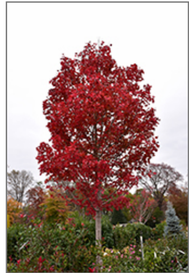
October Glory Red Maple in fall