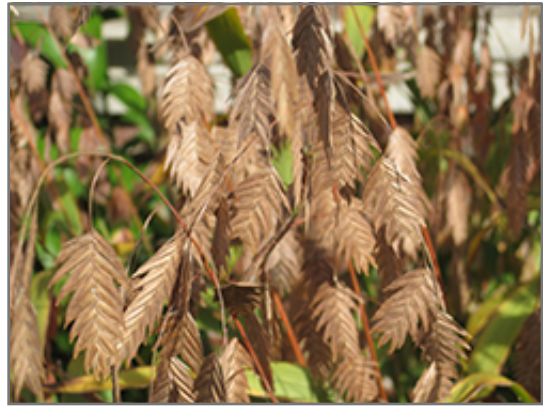
Northern Sea Oats fruit

Northern Sea Oats will grow to be about 4 feet tall at maturity, with a spread of 30 inches. Its foliage tends to remain dense right to the ground, not requiring facer plants in front. It grows at a medium rate, and under ideal conditions can be expected to live for approximately 10 years. As an herbaceous perennial, this plant will usually die back to the crown each winter, and will regrow from the base each spring. Be careful not to disturb the crown in late winter when it may not be readily seen!