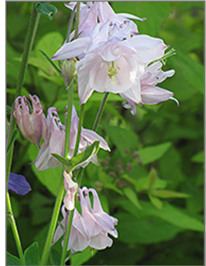
Double Pink Columbine flowers