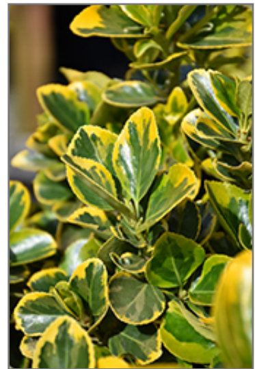
Gold Variegated Japanese Euonymus foliage