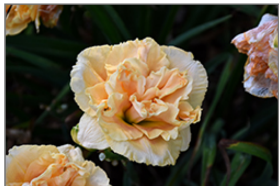
Rainbow Rhythm Siloam Peony Display Daylily flowers