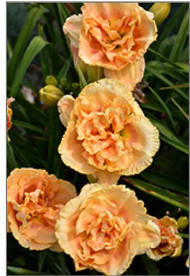
Rainbow Rhythm Siloam Peony Display Daylily flowers

Rainbow Rhythm Siloam Peony Display Daylily is recommended for the following landscape applications;